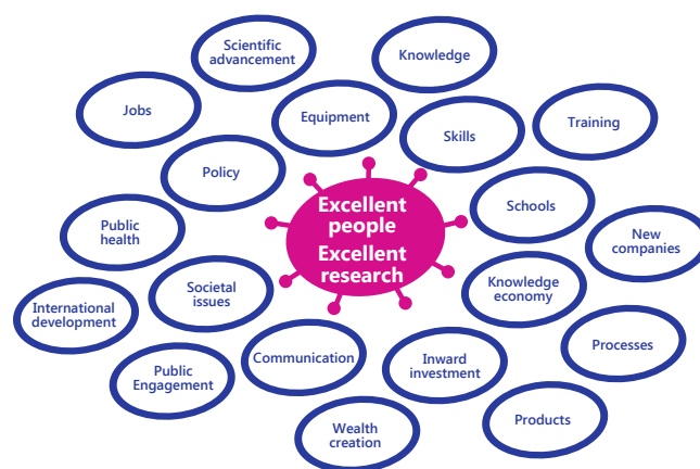
Figure 1: The variety of impact recognised by the UK Biotechnology and Biological Sciences Research Council

No one metric can hope to represent fairly all these possibilities, so it is worth exploring the variety of metrics that can be used. As noted above, there are risks and concerns about reading too much into any given statistic, but metrics do provide an accessible